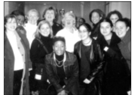
No Means No workshop in Toronto