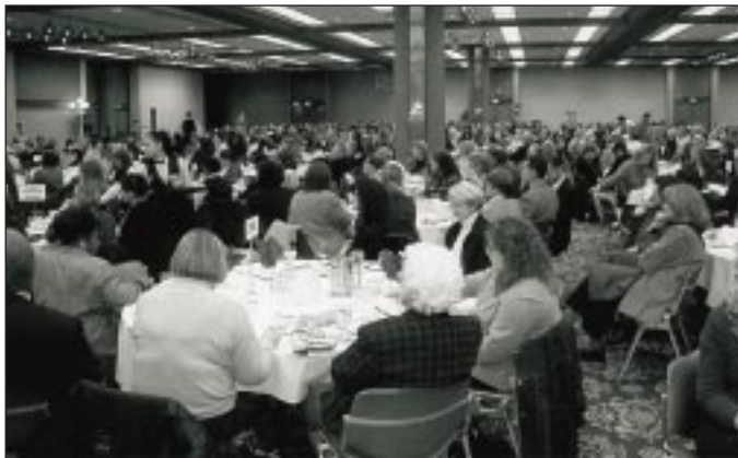
Persons Day Breakfast in Winnipeg, November 2002.

Equality Breakfasts: Volunteer committees organized successful Equality Breakfasts in Vancouver, Victoria and Nanaimo , with attendance of 550, 150 and 120 people respectively. A smaller luncheon event was also held in Chilliwack in celebration of Persons Day .