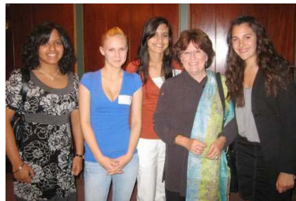
Louise Arbour with sponsored youth at PD Breakfast

Understanding the importance of engaging youth, LEAF as part of this year's Persons Day Breakfast, partnered with the Ontario Justice Education Network (OJEN) to host a mentorship program for high school students. One hundred young women selected by their teachers attended courtesy of various table sponsors who donated seats. In addition to the breakfast the young women were part of a closed session with Madam Arbour, and visited a courthouse and participating law offices to discuss cases. They also connected with female professionals from the sponsoring law firms in a day filled with mentoring, advice and career building. The program was a success for all participants. LEAF and OJEN hope to continue this venture in the future.