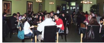
Persons Day Breakfast - Fredericton