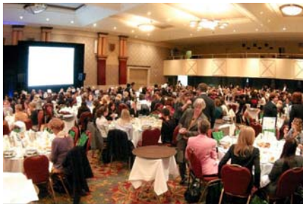
Fairmont Royal York Hotel

More than 800 people gathered in the early hours to celebrate with LEAF. The event was presented by TD Bank Financial Group and advocate sponsors C.A. Delaney Capital Management, OPSEU and Gowlings.